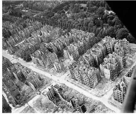
Typical bomb damage in the Eibek district of Hamburg, 1944 or 1945