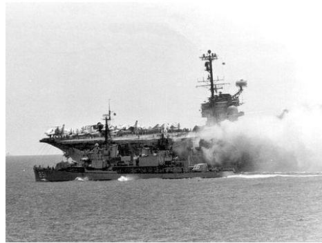
USS Forrestal on fire, the worst US carrier fire since WWII; USS Rupertus (DD-851) maneuvers to within 20 ft to use fire hoses.