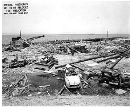
Photo # NH 96823 - Damage at Port Chicago, Ca. View looking north toward pier. Cleaning up the damage at the remains of the pier.